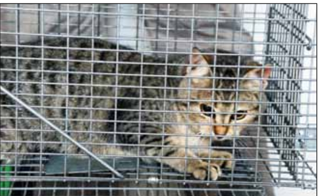
A stray cat captured at Caserma Ederle March 16.

"But we could be much more successful if people would just stop feeding them for a while and allow them to get hungry so they'll go inside the cages," said Trevisiol. See COMMUNITY Page 2