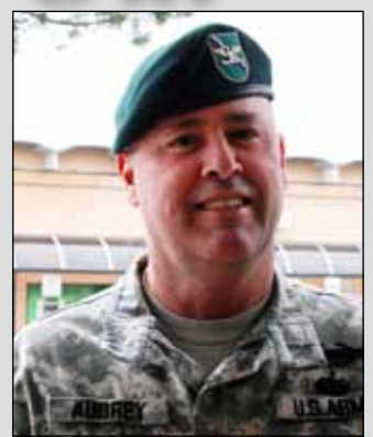
Col. Peter Aubrev U.S. Army Africa